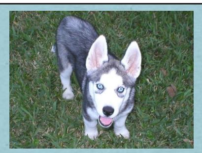
PLEASE DON'T POLLUTE PICK UP YOUR DOG'S POOP MEMBER ALL DOGS MUST BE O

PLEASE OBEYTHE SPEED LIMIT AND STOP SIGNS IN OUR NEIGHBORHOOD